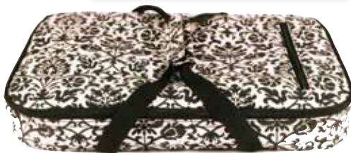
Vonny Casserole Carrier in Bohemian, $45, vonny.com