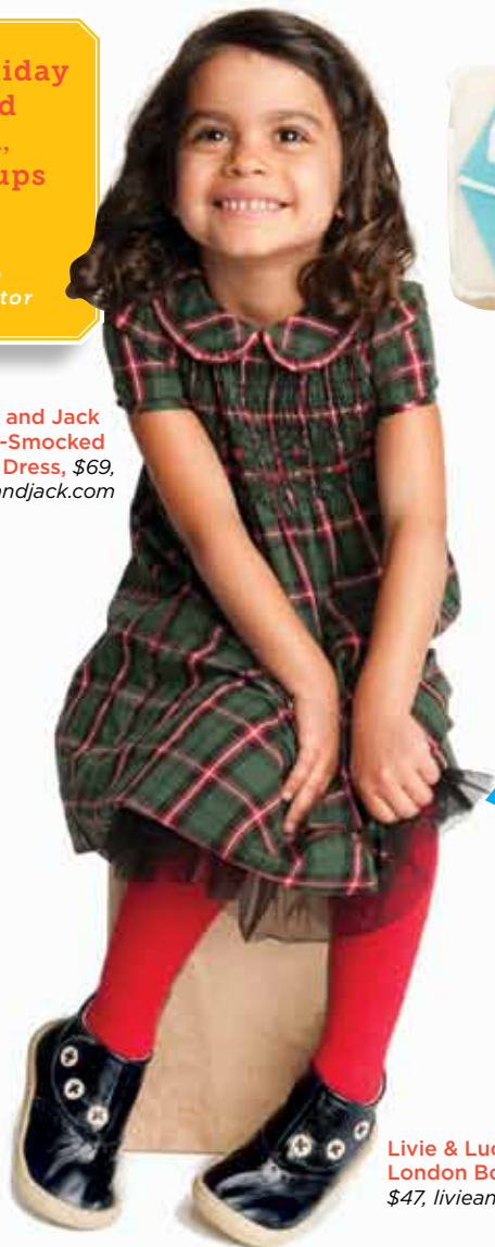
Janie and Jack Hand-Smocked Plaid Dress, $69, janieandjack.com