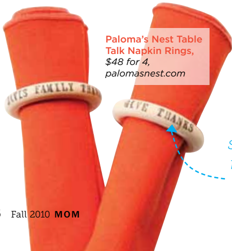
Paloma's Nest Table Talk Napkin Rings, $48 for 4, palomasnest.com