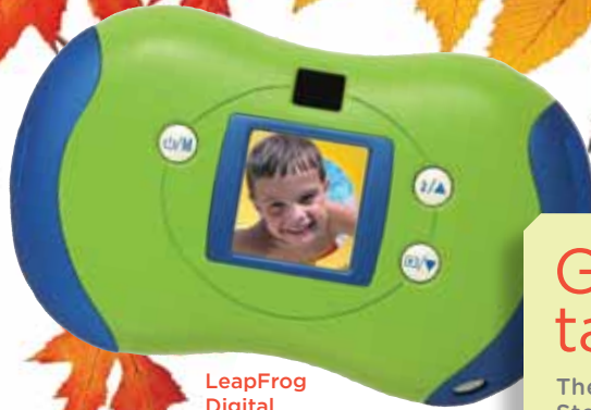
LeapFrog Digital Camera, $50, toysrus.com