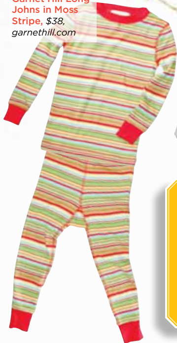
Garnet Hill Long Johns in Moss Stripe, $38, garnethill.com