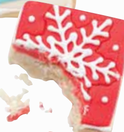
Better Bit of Butter Holiday Cookies, $34 for 8, betterbitofbutter.com

Black crinoline underneath adds a pretty fancy touch!