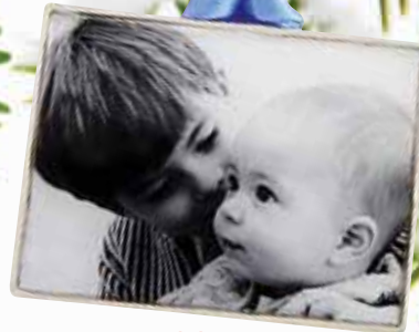
TJ & Co. Holiday Ornament, $150, tjandco.com ❁

“Make this holiday one of a kind with stylish, seasonal get-ups and gifts.”