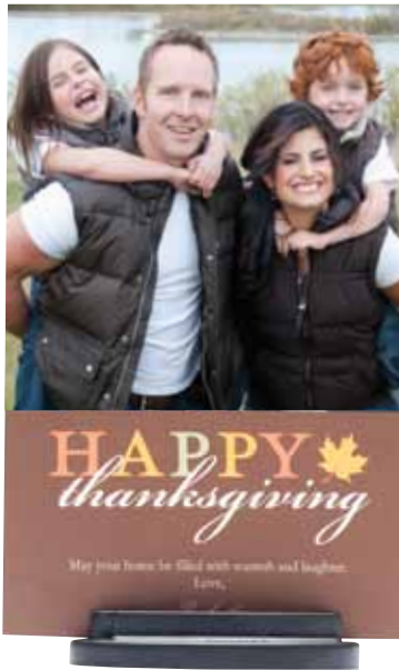
Photogator Stand, $15, photogatorstand.com , Shutterfly Happy Fall Colors 5 x 7 Photo Card, $21 for 25 cards, shutterfly.com